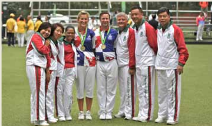
KCC pairs with England team, the Champion of Plate Section