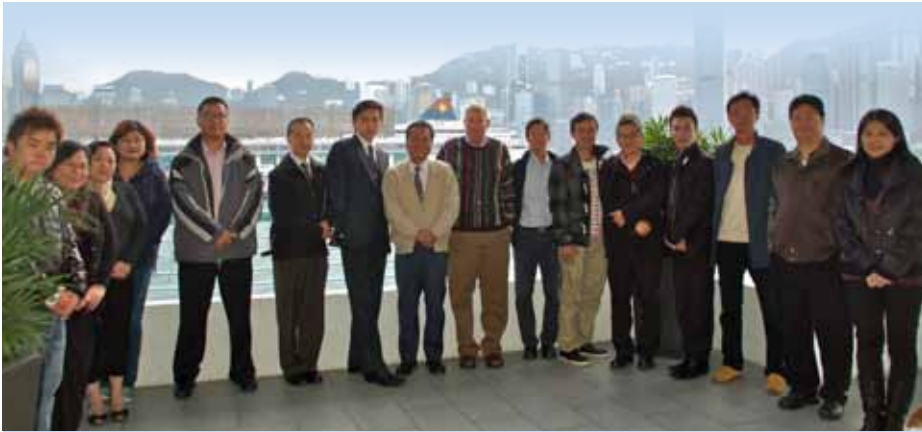
Management Meeting 9 December 2011